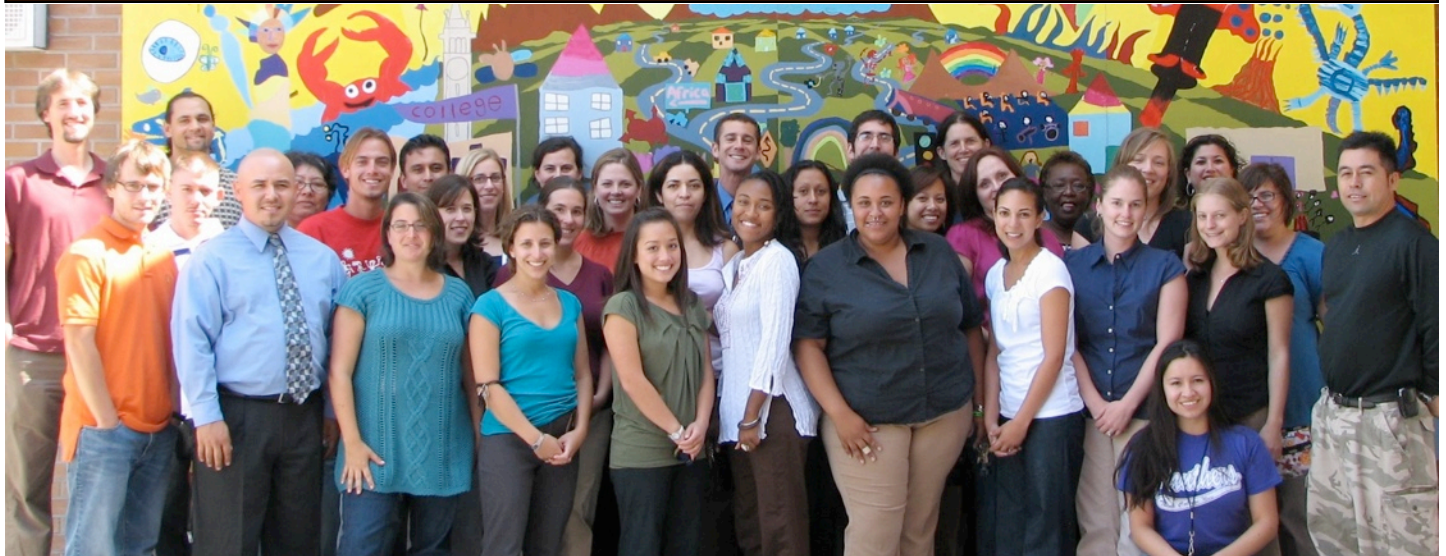
The 2008-09 Think College Now Staff in front of mural painted by after-school program students

These efforts will hopefully only bolster the amazing writing growth we saw last year: TCN 4th-graders had the second-highest improvement in the entire district, leaping from 19 to 70 percent at grade level or higher. With continued achievement growth, we hope to reach our Academic Performance Index (API) goal of 800.