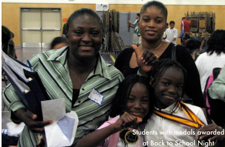
Students with medals awarded at Back to School Night

In ELA, students will use the widely successful Accelerated Reader to track reading comprehension progress, and TCN has partnered with Drew Hetzel to open a Reading Partners tutoring center on campus. [Continued on page 2]